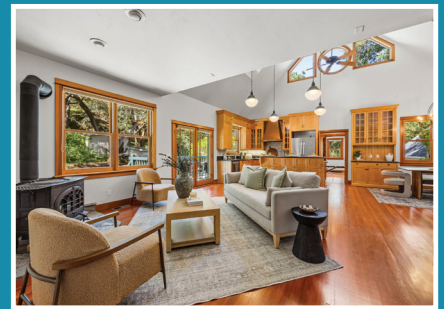
Open living space