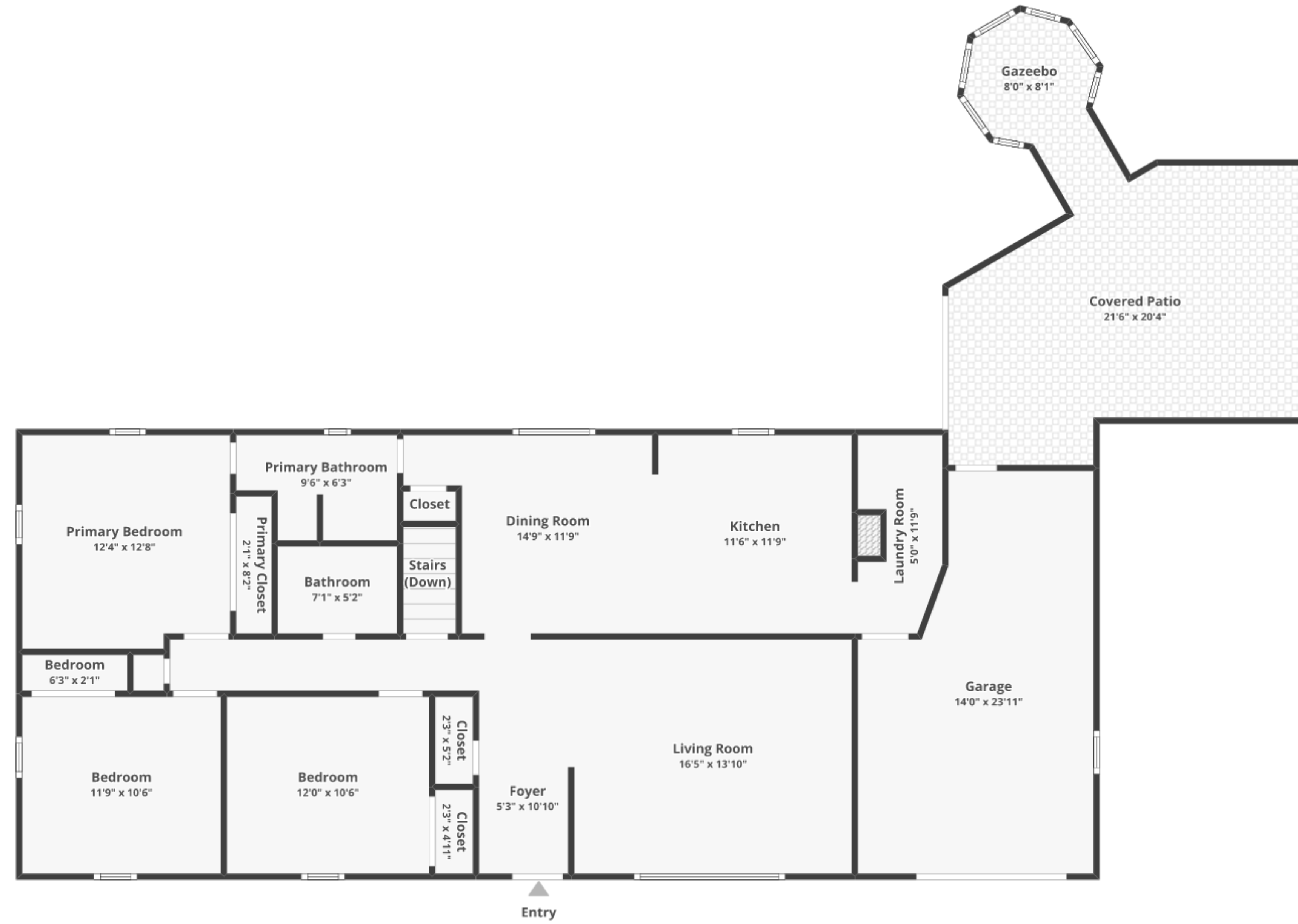
FLOOR 1 Finished area: ~1,264.53 sq. ft. Unfinished area: ~3.17 sq. ft.