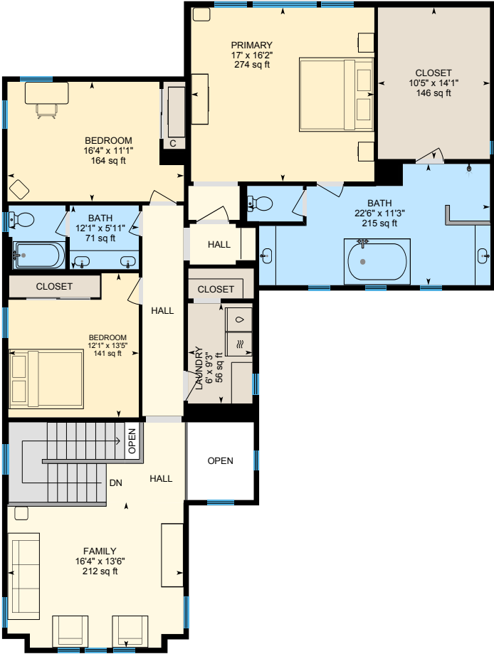
2nd Floor Finished Area 1753.89 sq ft