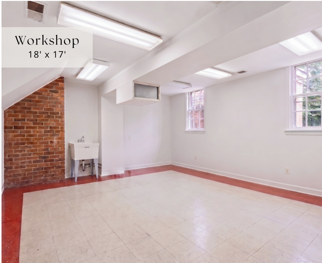
Workshop 18' x 17'