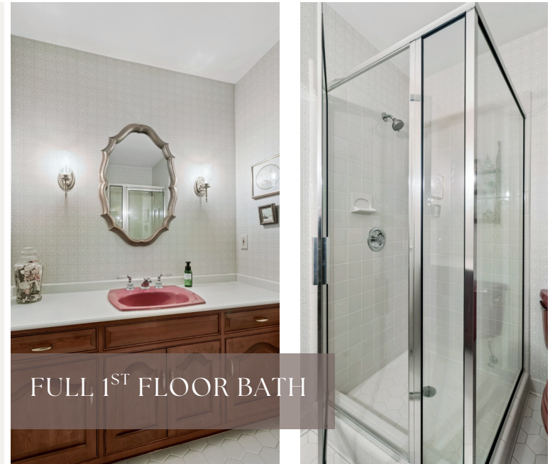
FULL 1 ST FLOOR BATH