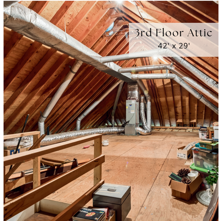
3rd Floor Attic 42' x 29'