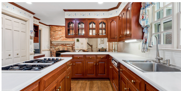
Kitchen 17' x 13'