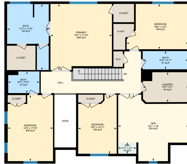
2nd Floor Finished Area 2032.87 sq ft