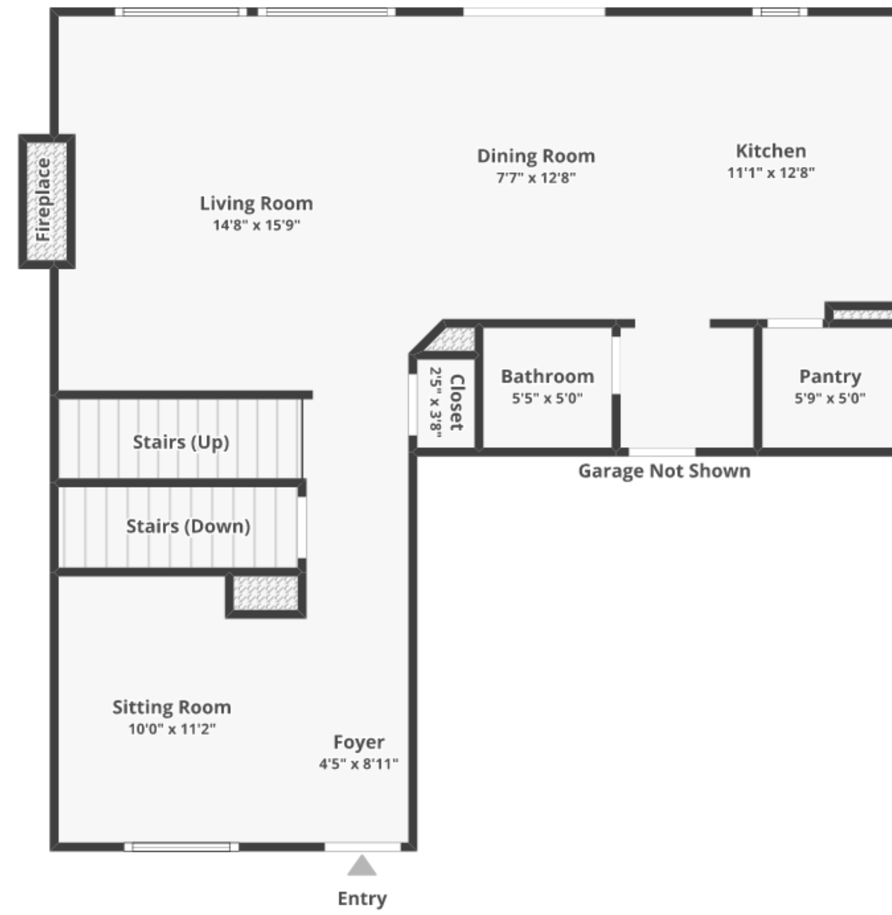
FLOOR 1 Finished area: ~806.65 sq. ft. Unfinished area: ~14.43 sq. ft.