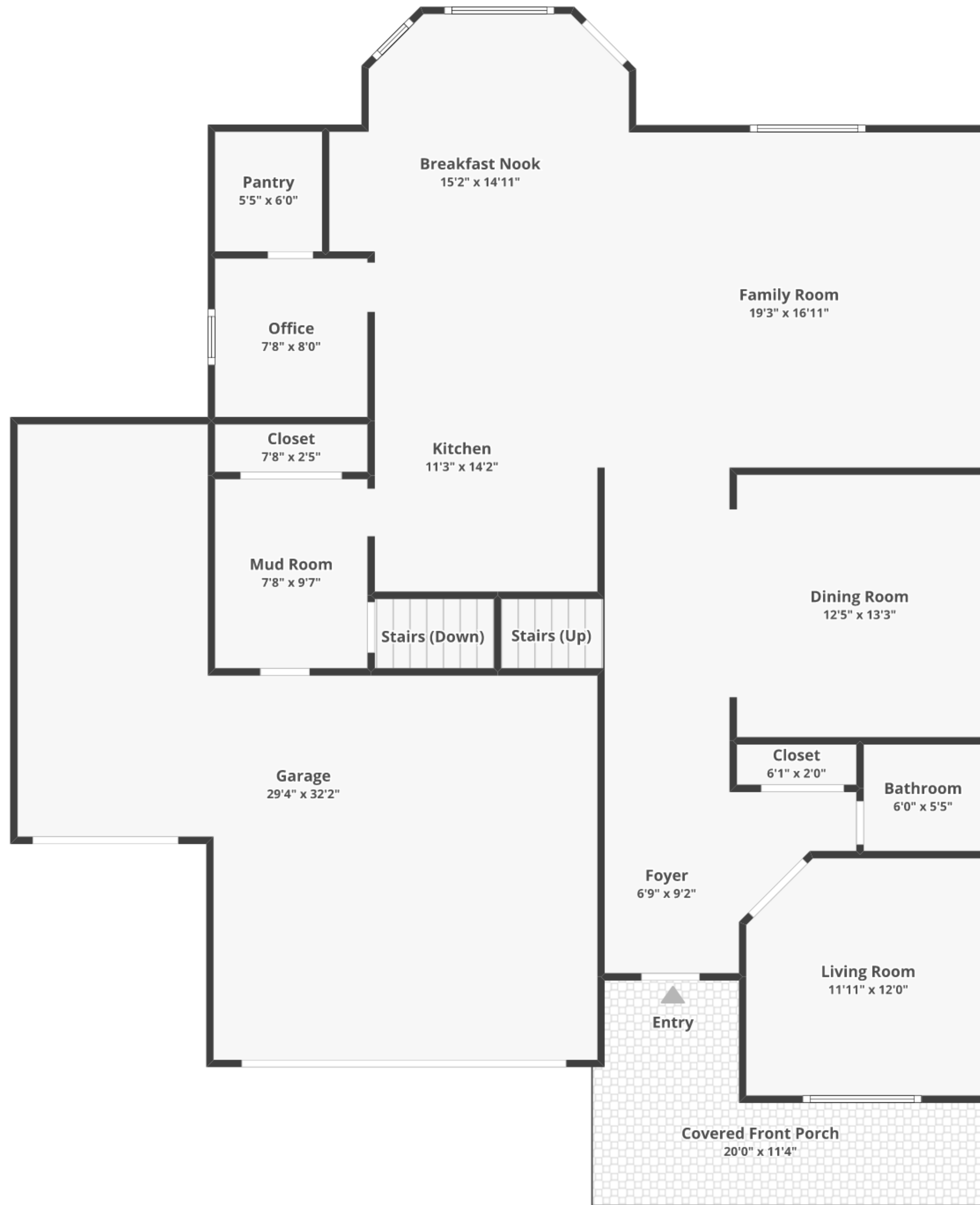
FLOOR 1 Finished area: ~1,425.55 sq. ft. Unfinished area: ~0 sq. ft.