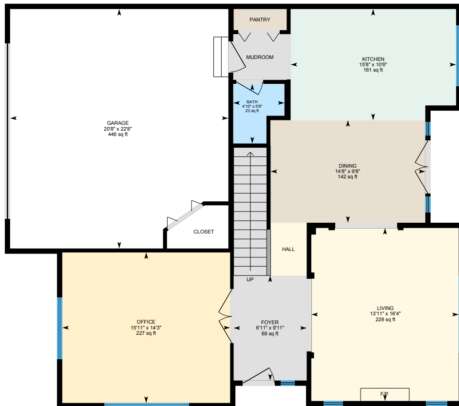
Main Floor Finished Area 1046.16 sq ft

Main Building: Above Grade Finished Area 2005.88 sq ft