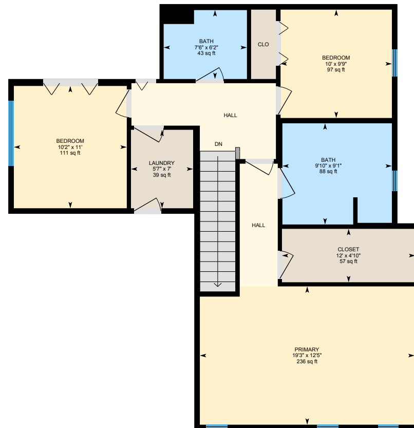
Upper Floor Finished Area 959.72 sq ft