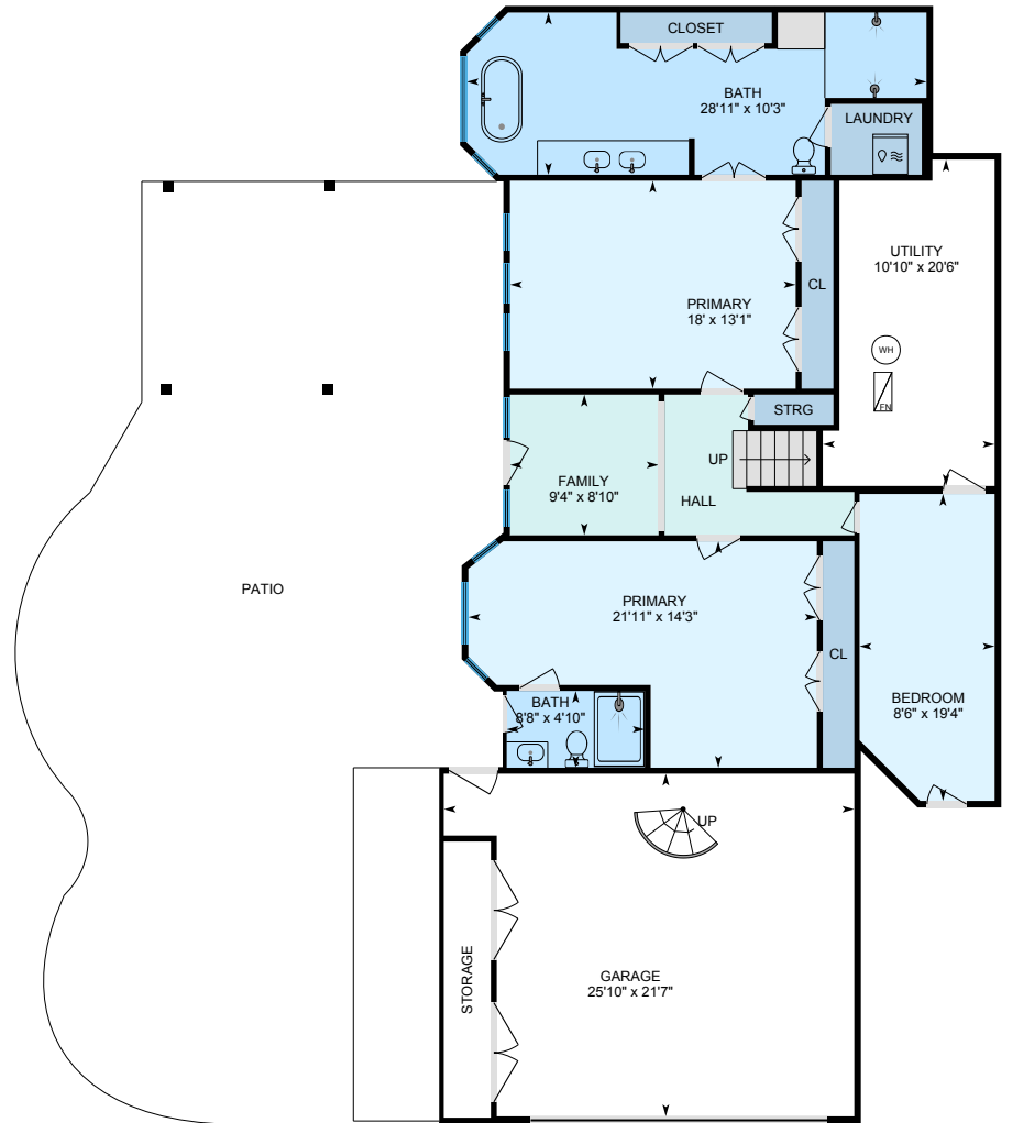
Lower Floor Finished Area 1324.58 sq ft