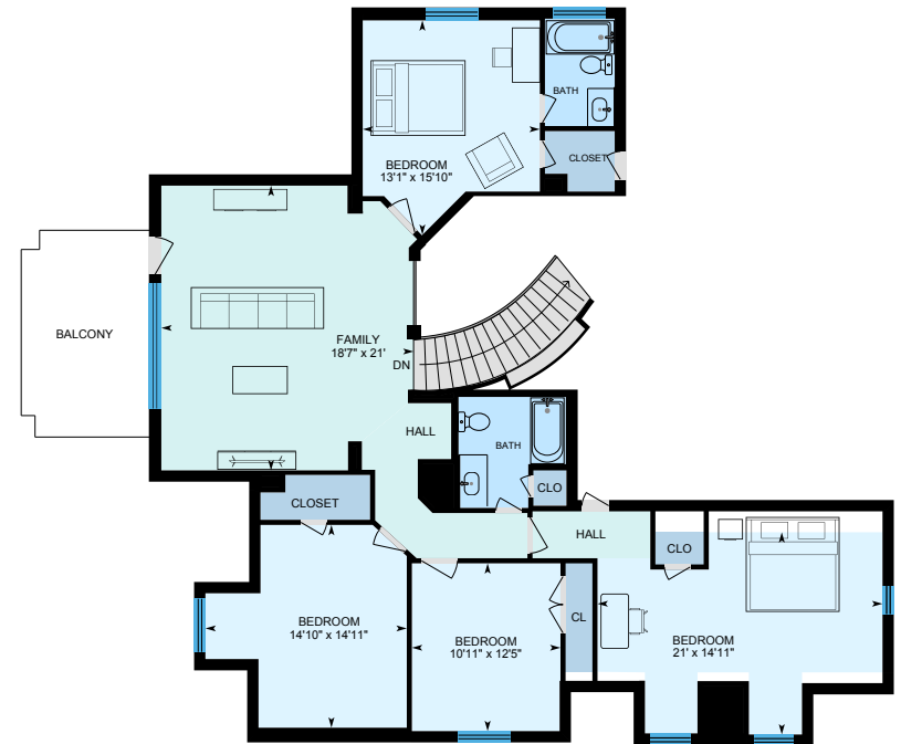
2nd Floor Finished Area 1714.18 sq ft