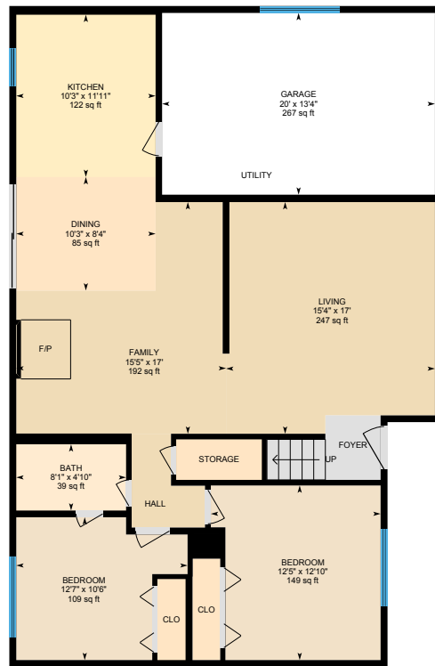
Main Floor Finished Area 1178.81 sq ft

Main Building: Above Grade Finished Area 1657.20 sq ft