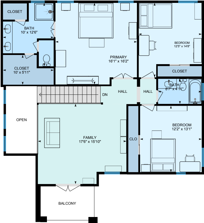
2nd Floor Finished Area 1285.22 sq ft