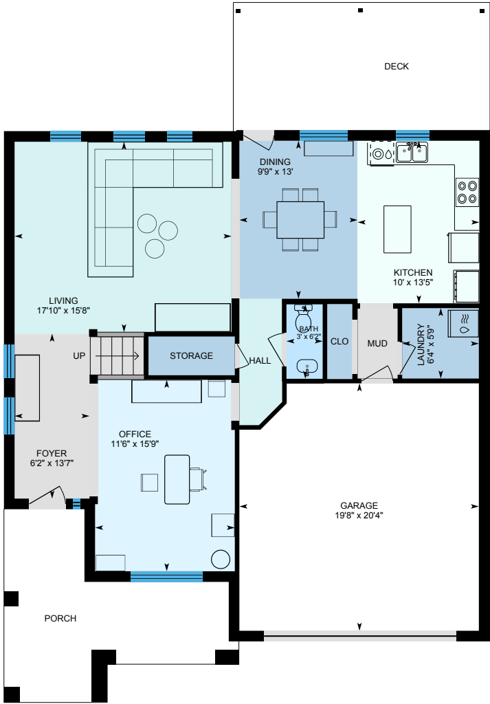
Main Floor Finished Area 1120.38 sq ft

Main Building: Above Grade Finished Area 2405.60 sq ft